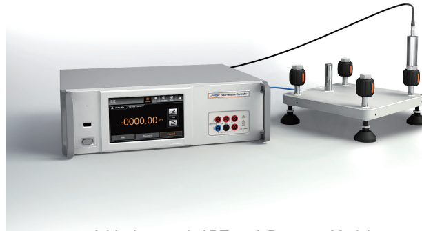
Additel 780 with ADT160A Pressure Module