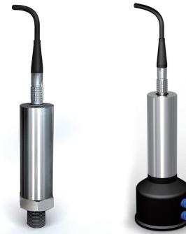
Gauge pressure Differential pressure