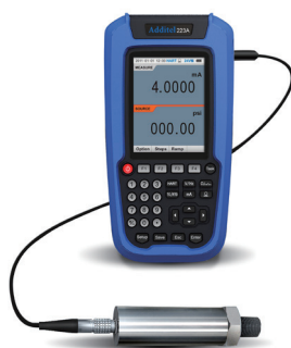
Additel 223A with ADT160A Pressure Module